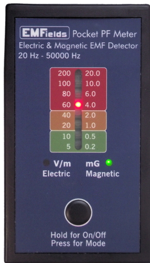
Pocket PF Meter